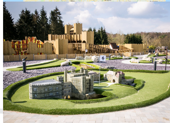
All images courtesy of the Leeds Castle Foundation